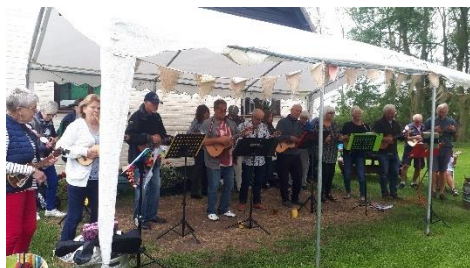
The Locks, Geldeston: Beccles Ukelele Group entertaining guests over an August lunch time.